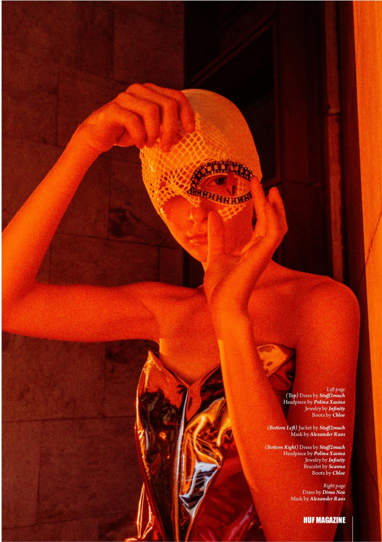
Left page (Top) Dress by Stuff2much Headpiece by Polina Kasina Jewelry by Infinity Boots by Chloe